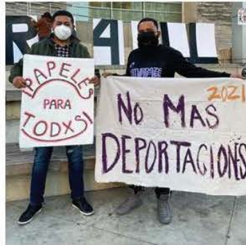
Inauguration Day action in San Jose, CA, organized by undocumented community (Jan. 20, 2021).