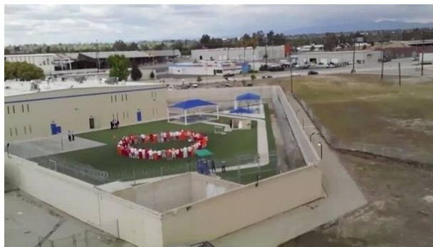
Mesa Verde hunger strike begins with an action of detained persons gathering outside, breaking protocol that only gives them 1 hour outside per day, requiring them to stay inside their cell for 23 hrs/day. They gather in heart formation and lay out their demands for immigrant and detainee justice (April 2020).