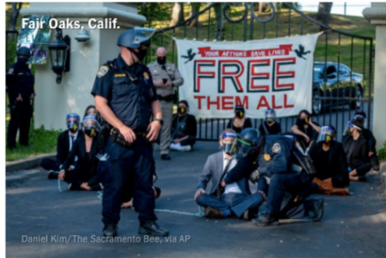
Fourteen undocumented activists and attorneys chained to Gov. Gavin Newsom's mansion in Sacramento, CA, demanding the release of all immigrant detainees (July 2020).