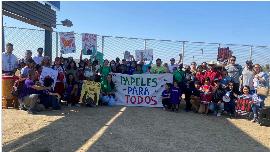
Papeles Para Todxs , organizers, labor rights activists, and community members outside of the Golden State Annex detention facility showing their support for the detained labor strikers on October 16, 2022.