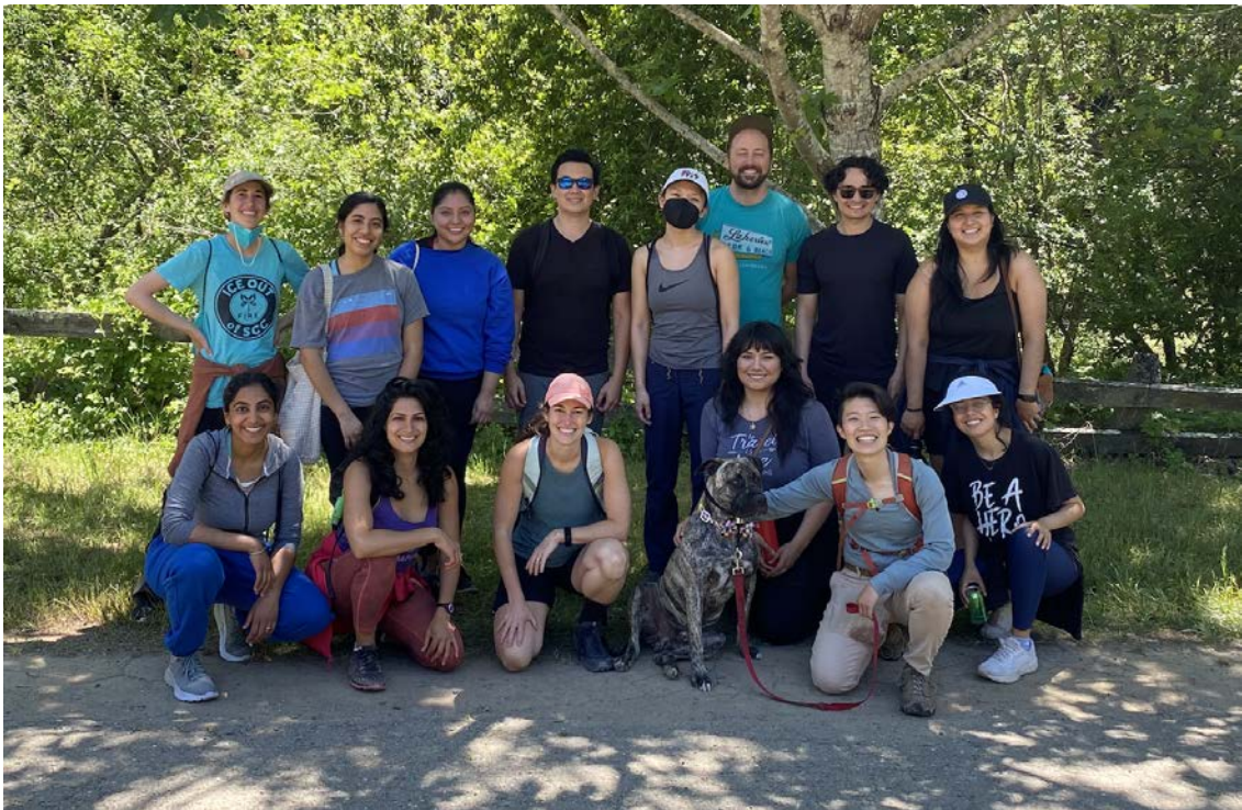
Photo of Pangea team at the annual Fun Day retreat.

As an organization, we not only faced 4 arduous years advocating in defense of immigrants in the face of a hostile administration, but we also fought to survive and adapt our work and lives through a deadly pandemic. We not only survived; we