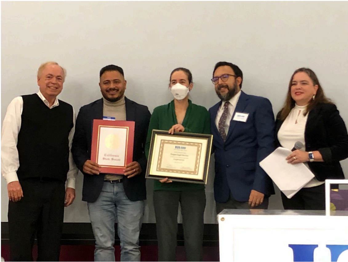
December 10, 2022 - Image of Jesus and Celine accepting the Cooperation Award