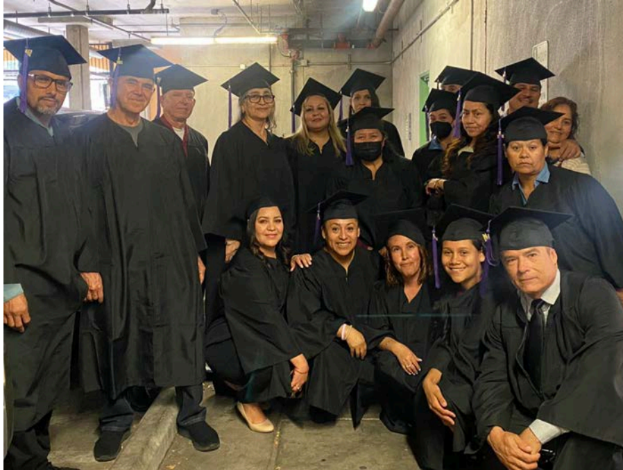
Image of Papeles Para Todxs 2022 graduates in their caps and gowns after the graduation ceremony