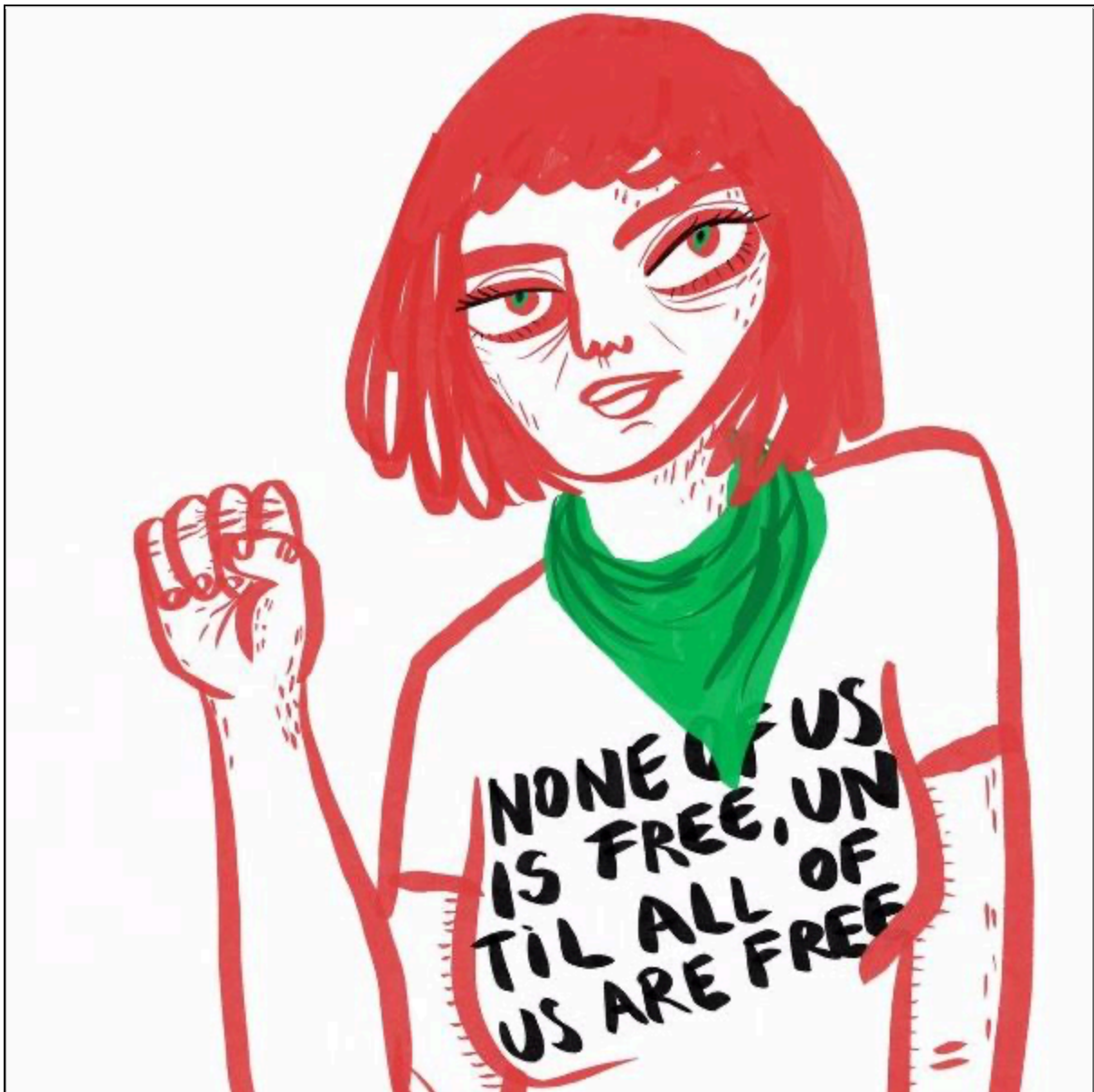
Illustration by asia bordowa, DE-MIL-I-TA-RISE .

Pangea statement on Gaza and Palestinian liberation: No Immigrant Justice Without Palestinian Liberation!