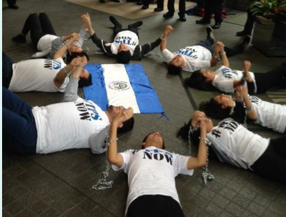
Sit-in participants demanding an end to deportations

press conference and sit-in at Senator Feinstein's office. Led by the Human Rights Alliance of Child Refugees and Families , and the Central American Refugee Action (CARA) , the action demanded an end to detention and deportations of Central Americans.