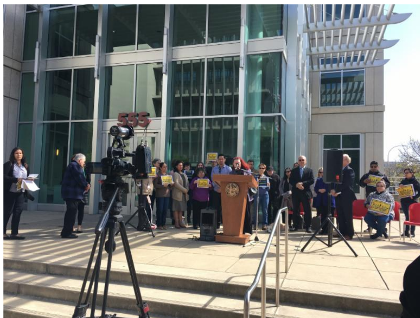
ILM launches rapid response hotline in San Mateo (Mar. 27, 2017).

By empowering those directly impacted by ICE raids to resist them collectively, we are multiplying our ability as organizers and attorneys to keep our immigrant communities united and safe. A pilot version of this project was launched with SFILEN in San Francisco on inauguration week and ILM's San Mateo Hotline launched in March 2017.