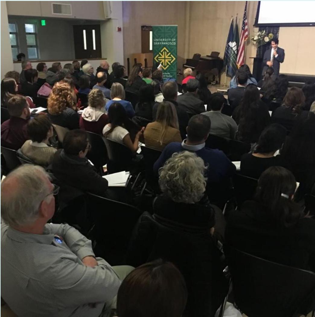
ILM Migra Watch Training, 2017

Earlier this month, Pangea worked with DeBug, ILRC, and the Santa Clara Public Defender's office to participate in a "clean slate" clinic. Our attorneys reviewed community members' criminal records to identify past convictions eligible for clearance, and provided advice on potential immigration consequences. Immigrants with past convictions - no matter how old - continue to be the most targeted and vulnerable under the Trump Administration, and clean slate clinics are critical to ensuring due process of law and keeping families together.