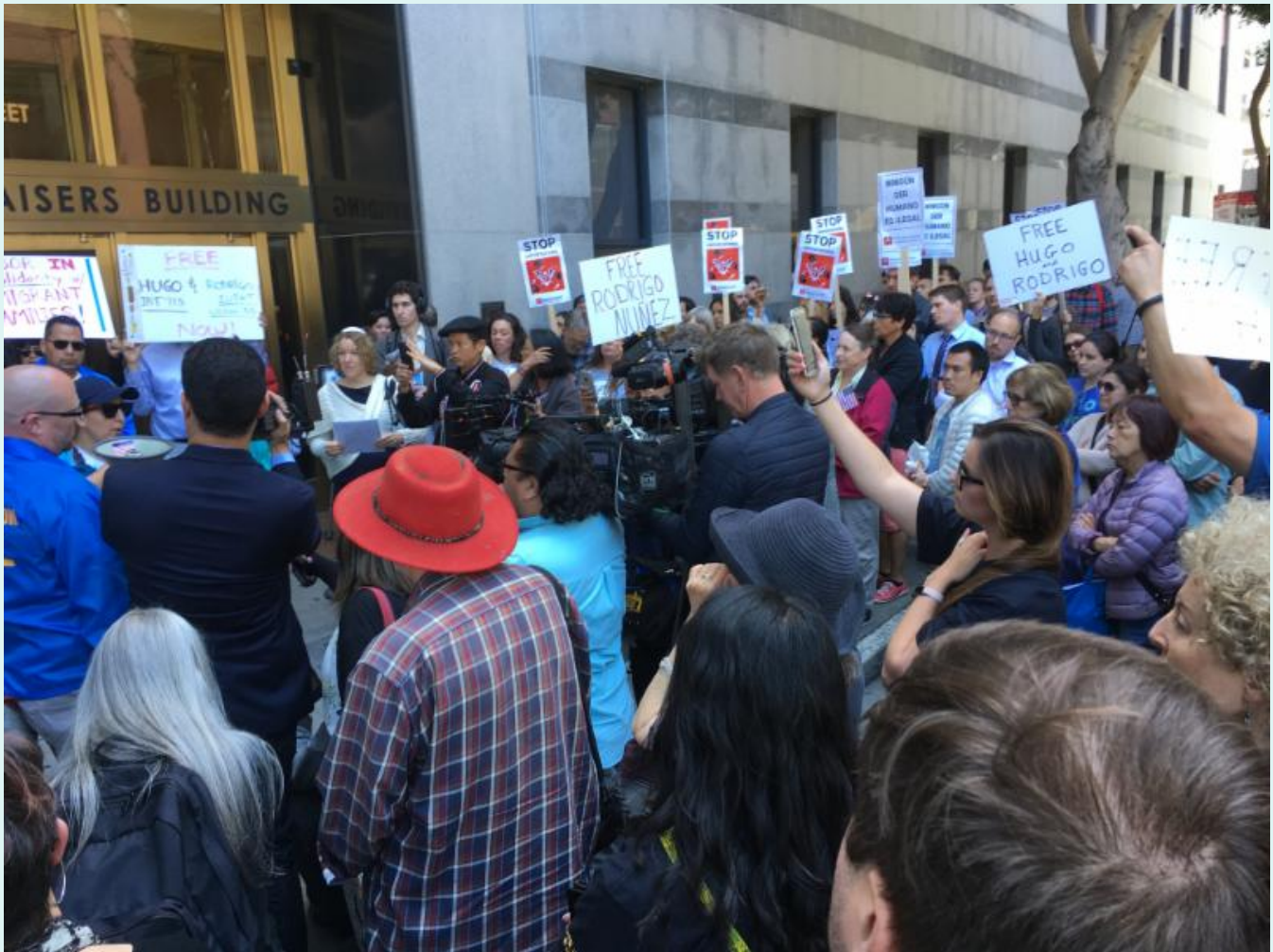
Pangea stands in solidarity to #FreeRodrigo and #FreeHugo from immigration detention, 2017

thousands of miles apart and not knowing what will happen to the other. Many of these families are refugees seeking protection in the U.S. from death threats, rape, and domestic violence. But they end up trapped in captivity in the immigration system with the only way out being deported or paying very high bonds of $8,000-30,000 in exchange for their freedom. We have a long way to go to bring change, but Pangea is committed to realizing our vision of ending immigrant detention altogether one case, one rally, one local policy, and one empowered community member at a time.