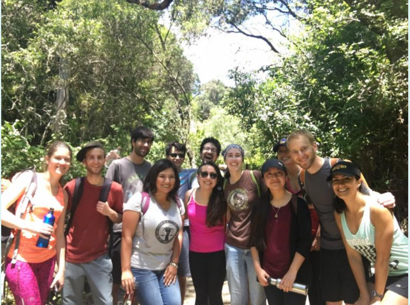
Pangea Team Fun Day (June 2017)

Thank you for continuing to stand strong with us and supporting our work. Please consider getting involved in one of these 7 ways , and please consider making a donation !