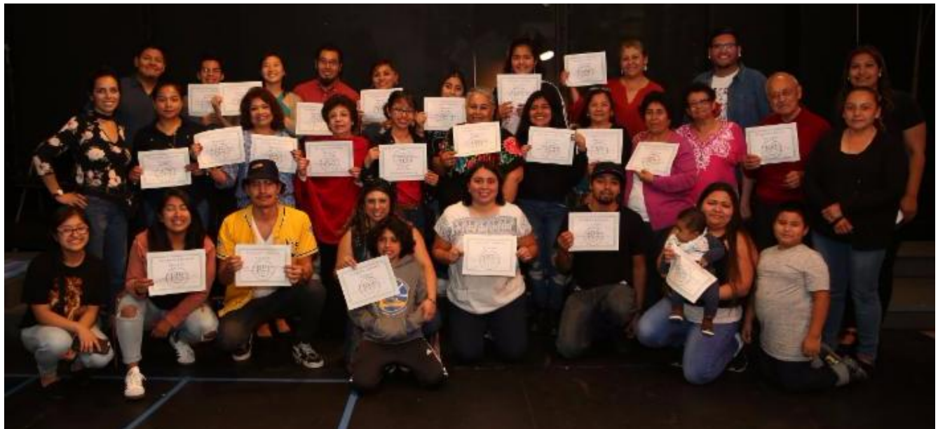
30+ Promotoras complete five full-day sessions of participatory education courses through ILM (Sept. 2017).

Pangea continues its leadership in the Immigrant Liberation Movement (ILM). In August and September, Pangea attorneys and ILM organizers worked together to train 30+ community members as promotoras (borrowing the name from lay community members and leaders trained to provide health education in Latin American communities). With ILM, promotoras are legal advocates, mentors, and educators for the immigrant community.