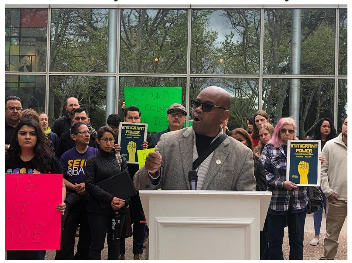
The community stands united for sanctuary in front of the offices of Santa Clara County's Board of Supervisors (April 2019)

In March and April, after a tragedy exposed Santa Clara County's need for better mental health and medical services for the homeless, the San Jose Mayor and Police Chief opportunistically distorted the incident to criminalize immigrants in the media. Anti-immigrant forces threatened to pass local legislation <u>using divisive rhetoric to dismantle our strong</u> sanctuary policies. But the Santa Clara community united.