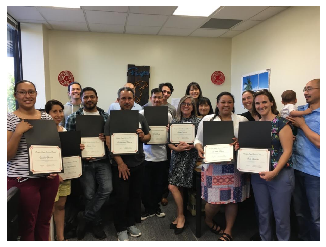
Pangea honored community partners with certificates at our San José office warming party (April 2019)

Pangea had an office warming party to celebrate our new space in the San José Unified School District building. We thanked and honored our community partners that continue to lead us and light the path forward in the movement for immigrant rights and liberation.