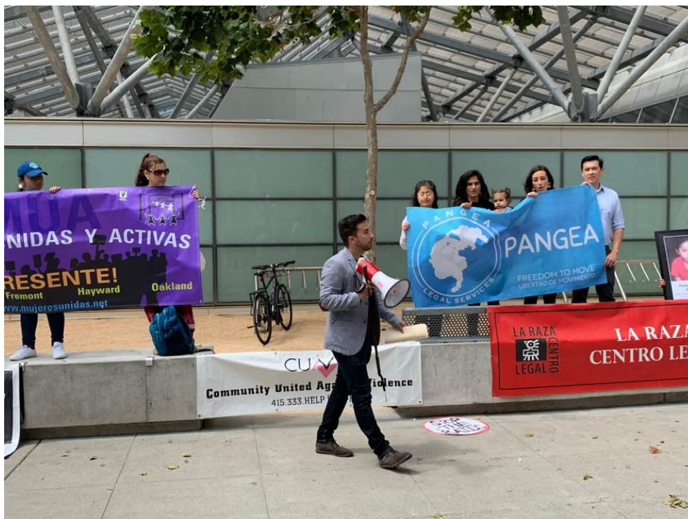
Pangea and partner organizations rally to demand freedom and dignity for all migrants, tell Pelosi and Democrats to stop funding Trump's terror and border encampments (July, 18 2019)

The FREE SF Coalition , of which Pangea is a member, held a press conference outside of Speaker Nancy Pelosi's Office in San Francisco to hold her accountable for the Democrats' partnership with Trump to fund $4.6 billion in DHS enforcement at the border. The community held Pelosi accountable for her false portrayal of the funding as "humanitarian aid," when in fact the $4.6 billion will fund more ICE and CBP agents, prisons and encampments, and terror, raids, and separations of immigrant families.