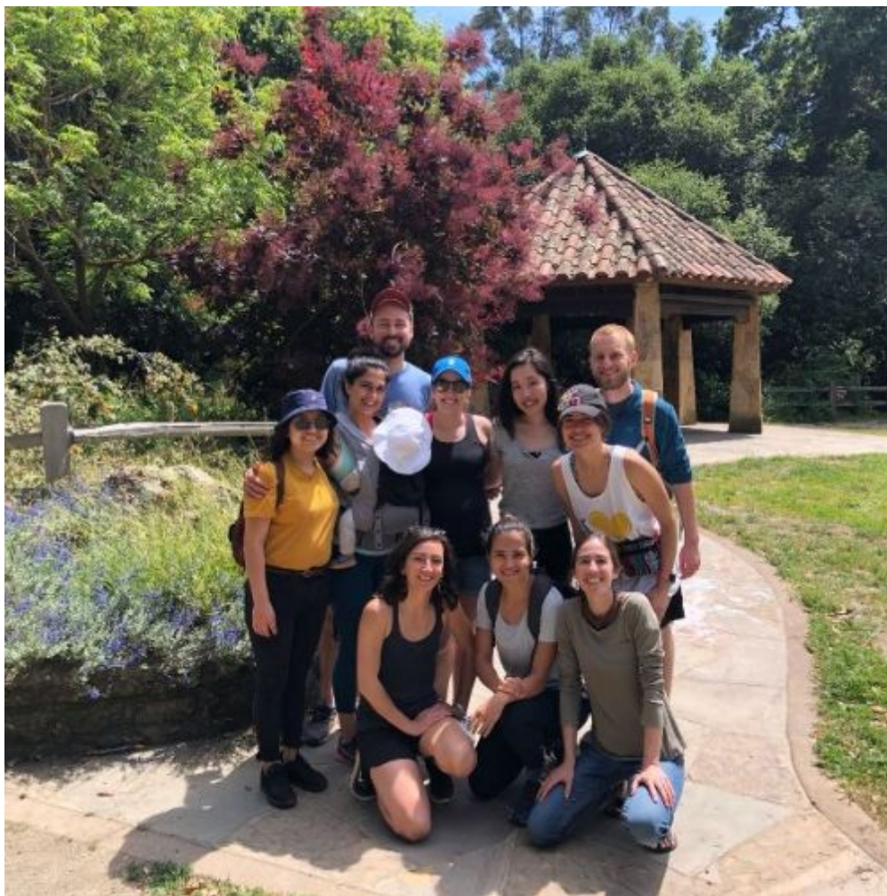
The Pangea team on our annual Fun Day in June 2019!