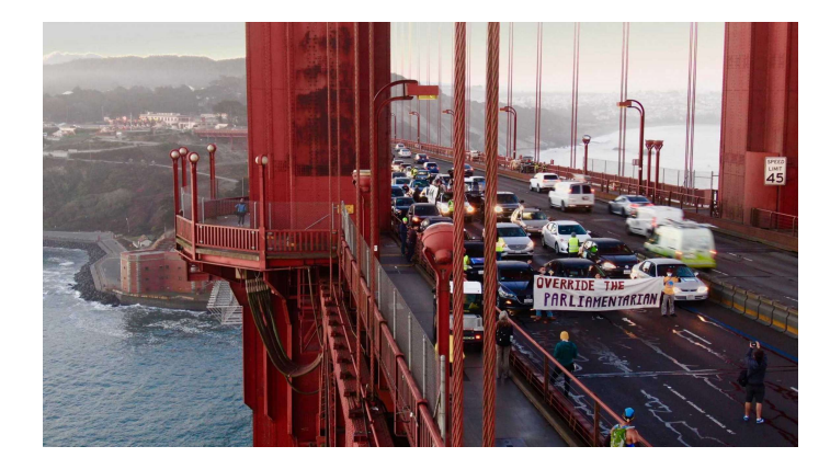
at the car protest shutting down the Golden Gate Bridge, Sept. 2021

Check out the coverage by <u>The Washington Post</u>, <u>SF Chronicle</u>, <u>LA Times</u>, <u>The Hill</u>, <u>USA Today</u>, <u>Fox News</u>, <u>Kron4</u>, <u>NBC Bay Area</u>, <u>KTVU</u>, <u>CBS</u>, <u>Marin Independent Journal</u>, <u>Independent</u>, <u>Press Democrat</u>, <u>SFist</u>, <u>APNews</u>, <u>ABC7</u>, <u>Sacramento Bee</u>, <u>Yahoo News</u>, <u>Telemundo 48</u>, <u>Mlienio</u>, and <u>Univsion</u>.