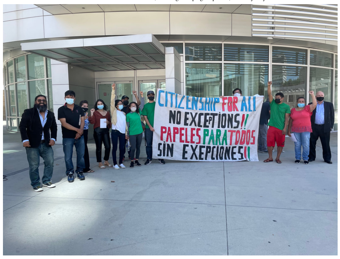
PPT is a movement for and by undocumented immigrants that demands citizenship for all 11 million undocumented immigrants living in the United States without exceptions. Pangea staff are founding members of PPT and continue to support and work alongside this movement.