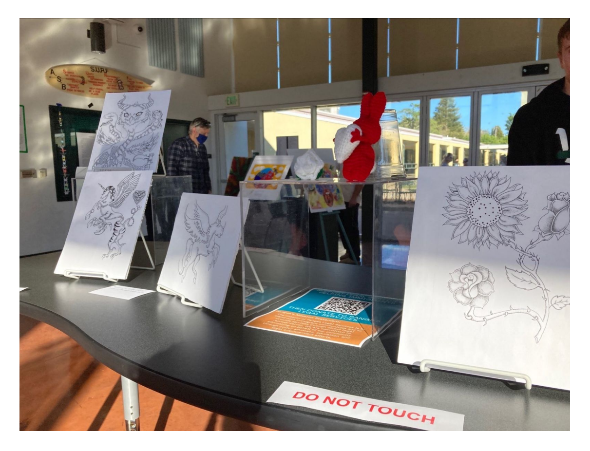
Drawings and crochet by detained immigrant artists

This past March, students at Archie Williams High School in San Anselmo, California, organized their first annual art exhibit, uplifting BIPOC voices, visions, and dreams.