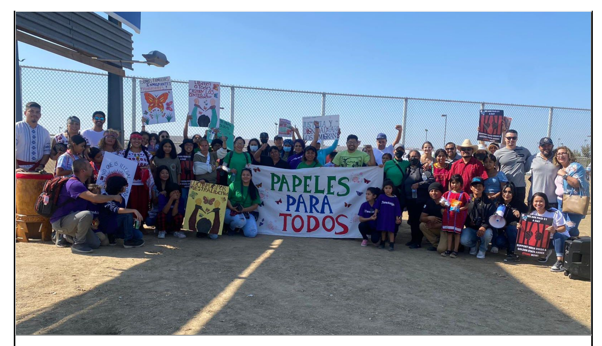
<u>Papeles Para Todxs</u>, organizers, labor rights activists, and community members outside of the Golden State Annex detention facility showing their support for the detained labor strikers on October 16, 2022.