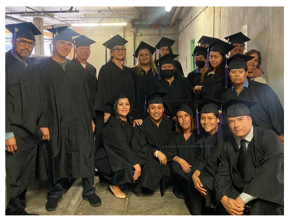
Image of Papeles Para Todxs 2022 graduates in their caps and gowns after the graduation ceremony

The graduates now have the tools to mobilize and participate in civic activities and represent their partners, parents, and friends when advocating for immigrant-friendly polices in their local counties.